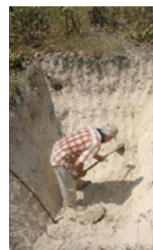
Top: Professor Benjamin Bostick speaking about soil improvement at IWC's 20th anniversary. Bottom: Soil analysis in Cambodia prior to teak plantation establishment.

agricultural products. Large fallow land is available globally. Former tropical forest lands are the largest land area of potentially arable land on earth, Buresh et al., 1997 estimates over 2 billion hectares globally. FAO estimates that roughly 100 million hectares of forestland was lost from 1990 to 2005, some of this land is today used for production, but most lies fallow.